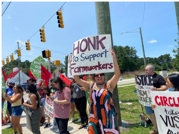
SAF Boycott Vuse Protest at Circle K Fayetteville, NC July 3, 2021