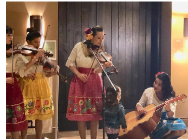
Mariachi in Training