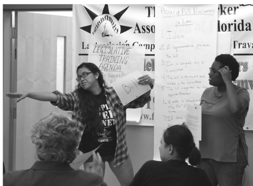
YAYA members lead us in a legislative training.