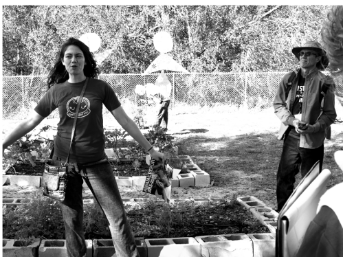
We toured the FWAF Community Garden at the Hope CommUnity Center.