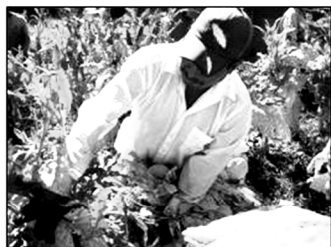
Farmworkers pick the tobacco leaves.

Visit NFWM's website Boycott VUSE page to read NFWM's boycott endorsement resolution, for background on the campaign and actions you can take to support farm workers.