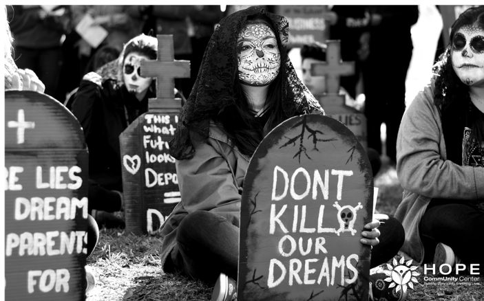
"Funeral of Dreams" hosted by the Hope Community Center