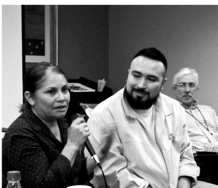
CIW joined us to give an update on the Fair Food program.