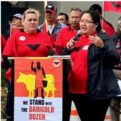
Dairy workers speaking about the Darigold fast