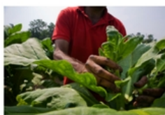
Farm workers pick the tobacco leaves

Because farmworkers are excluded from many federal labor laws passed in the 1930s, farmworkers aren't guaranteed freedom of association or the right to collectively bargain. Fear of retaliation and blacklisting leaves farmworkers in a dangerous and precarious situation that discourages them from speaking out against abuse and exploitation. Until workers have a voice in their workplace, these abuses will continue.