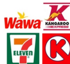
Convenience stores sell VUSE e-cigarettes to consumers across the US