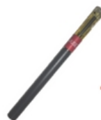
Reynolds extracts the nicotine, converts it to a liquid and inserts it into VUSE e-cigarettes