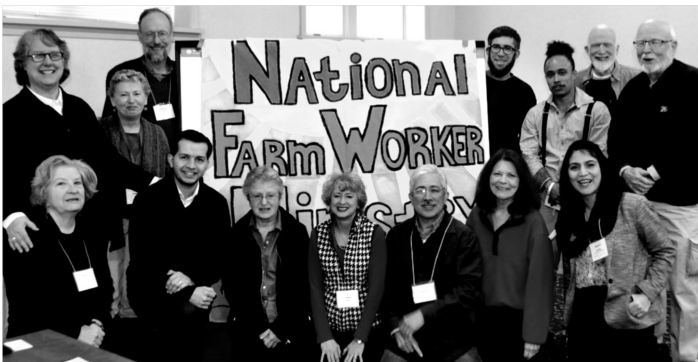
NFWM Board, staff and guests January 2016 Board Meeting

A number of NFWM Board representative changes have taken place in the past several months. We send a hearty THANK YOU to those going off the board for their faithful service and to those coming on for their eager start.