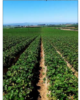
Strawberry fields at Sierra Farm

NFWM was among the founding organizations of EFI and has representation on the multi-stakeholder steering committee, along with: Andrew & Williamson Fresh Produce International, Bon Appetit Management Company, Calvert Investments, Center for Science in the Public Interest, Consumer Federation of America, Costco, Farmworker Justice, Farm Labor Organizing Committee, Oxfam America, Pesticide Action Network of North America, Pineros y Campesinos Unidos del Noreste (PCUN) and the United Farm Workers.