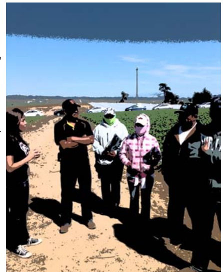
The farm workers pictured above are members of the leadership team at Sundance Berry Farms at Moss Landing, CA