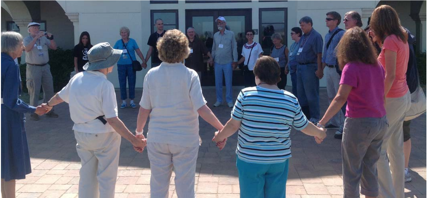
National Farm Worker Ministry Board Members praying at the headquarters of D'Arrigo Farms

Did you know that Santa Clara University is the oldest institution of higher learning in California? Also, that it is the first to be named after a woman? It is also one of the most beautiful campuses in the country. Thirty of us from all over the country representing many different religious backgrounds, spent two days in mid-August, (the executive committee spent an extra day) attending the NFWM board meeting in Santa Clara, examining our work with farm laborers, visiting D'Arrigo Farms and Sundance Berry Farms, hearing about the work of two UFW (United Farm Workers) farm worker organizers, listening/watching oral and video reports from NFWM staff, looking at our budget and interacting with each other. We became re-energized and excited about new developments.