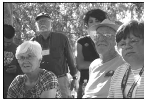
Hearing from workers who are grateful to learn of NFWM support around the country.