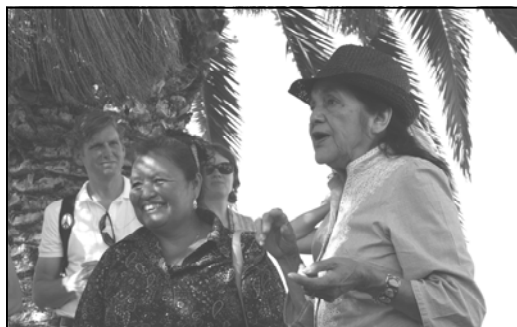
Dolores Huerta talks about the organizing work of the Dolores Huerta Foundation.