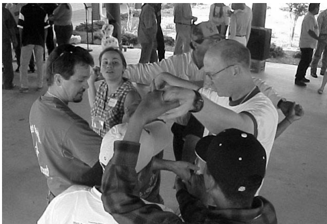
Participants in the July 7 Sister Communities Celebration make a "Human Knot".

"Mostly, I liked the communication between the Hispanics and the Americans-all the people that help us and motivate us to continue forward in our daily working lives...Now, I know that through unity with others, we can move forward, move forward with our problems."